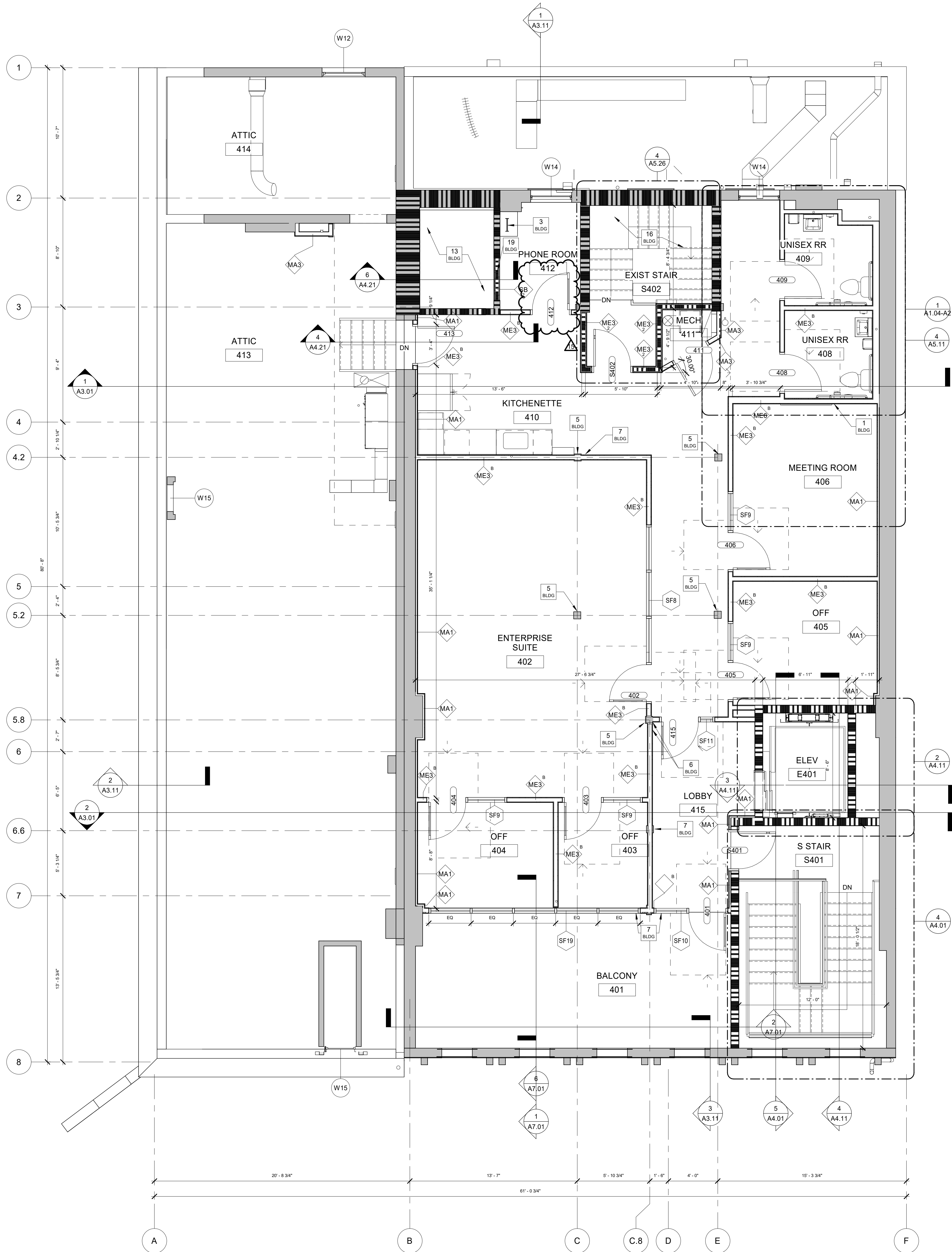
1 Floor Plan 4th Floor, Plan A1.04-A1 1/4" = 1'-0"

\\sml-local\user\user\Share\Documents\COhatch\Leader Bldg - Architectural (R22)_lgmml.rvt 7/25/2023 9:20:59 AM