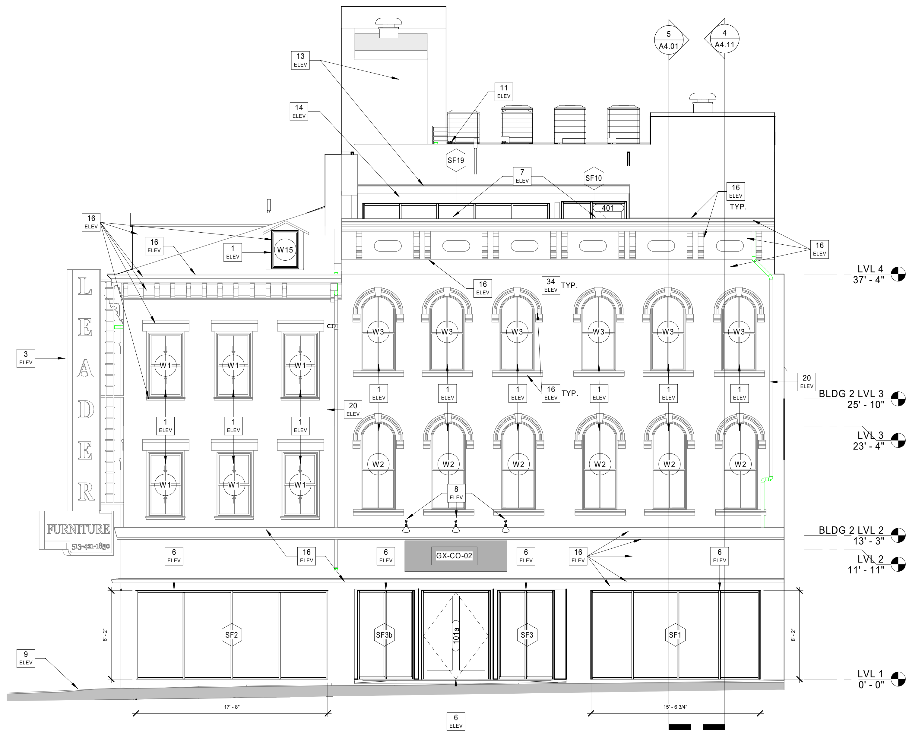
2 Building Elevation South Elevation A2.22 3/16\"/>